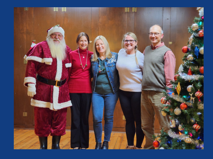
M&O Holiday Party

Annual Newsletter 2022-2023 Message from the Department Chair MESSAGE HERE